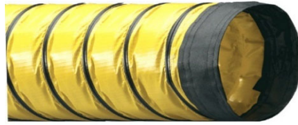
SHOWN WITH SEWN CUFF

The Model VB3 is an insulated blower hose designed for temporary heating and cooling. It resists UV rays, ozone, and mildew, and can be easily stored as well. Made with flame retardant UL94V-O rating Polyester-Vinyl laminate, reinforced with a spring steel wire helix and external PVC wearstrip. 1" fiberglass insulation (R-Value=4). Compression Ratio is 5:1.